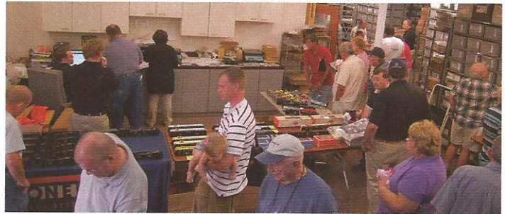
Visitors to the open house also had a chance to purchase a wide range of Lionel products as well as items from the parts inventory.

In addition to a tour of the facility, visitors at the open house were treated to several clinics, raffles, and some goodies to eat, and those who wished to could also purchase parts and other items at a nice discount.