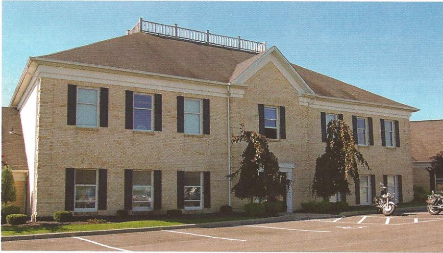
Canfield, Ohio, is home of the Lionel Customer Service Center.